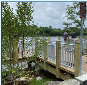
Fishing & Kayak Areas